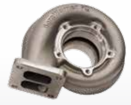
H-Type Turbine Housing