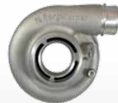
Compressor Cover SX-E Style

See page 37 for: Speed Sensor, Turbine Gaskets & V-Bands, Oil Drain Gasket & Fitting, Actuators & Brackets