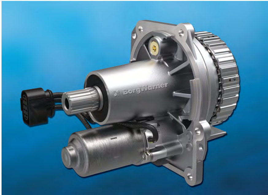
Figure 2. Compared with previous technologies, BorgWarner’s well-proven GenV AWD coupling features a light and compact design for reduced vehicle complexity and easier integration into the drivetrain.

sport utility vehicles (SUVs) because of their advantages off the road, are now in great demand across all vehicle segments. In particular, drivers value the improved handling, dynamics and stability resulting from these technologies.