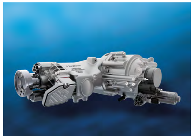
Figure 1. BorgWarner's compact torque vectoring (CTV) technology facilitates improved handling, stability and vehicle dynamics.

Used to improve the consistency of steering wheel input versus yaw rate, controlled changes to the torque distribution between the wheels on the left- and right-hand side enhance the vehicle dynamics and the response. While the total drive torque remains the same, the vehicle dynamics software