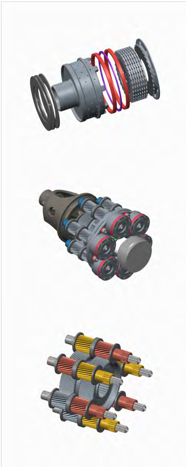
Figure 3. Low-impact platform integration is enabled due to the system’s modular design, facilitating the use of the units in applications across different vehicle platforms and models.

“bolt-on” unit on the rear differential, CTV can allow the same base vehicle or platform to be offered with or without optional torque vectoring.