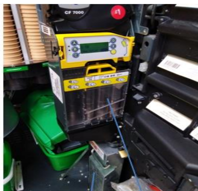
Cash Box Coin Mechanism

This way the coin mechanism would always be full and drop straight into the cash box. No change given. Sodexo staff will check the coin mechanism daily and ensure this is full.